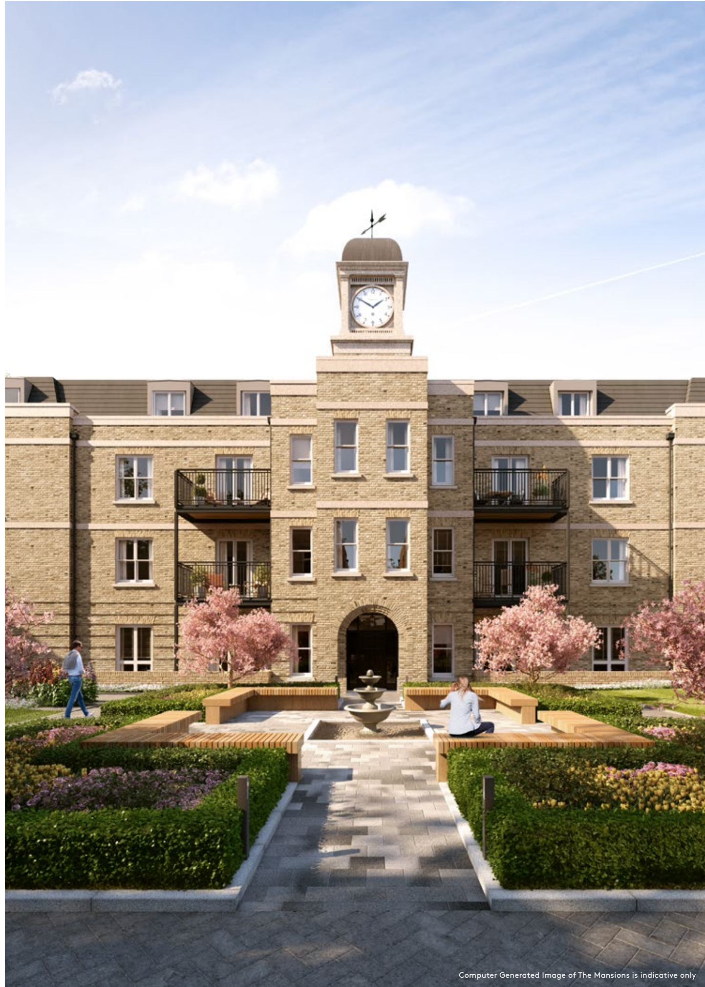
Computer Generated Image of The Mansions is indicative only