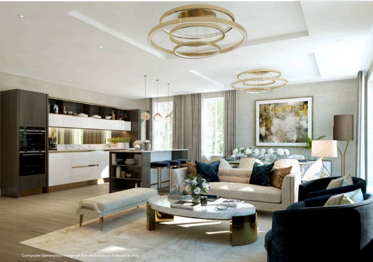
Computer Generated Image of The Mansions is indicative only

The definition of elegant living, this magnificent collection of one, two, three and four bedroom apartments and penthouses sits at the heart of this exclusive development, amid glorious green parkland, in one of the most desirable areas of London.