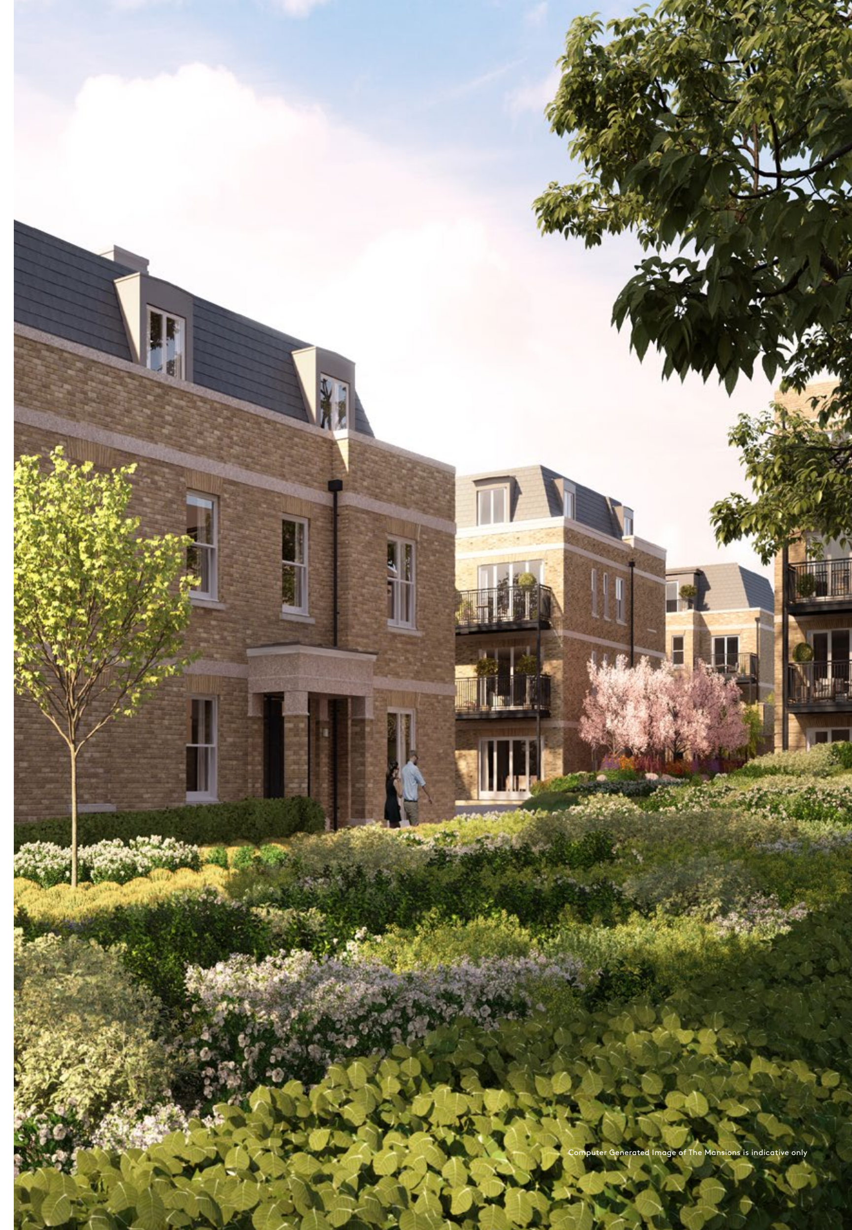
Computer Generated Image of The Mansions is indicative only